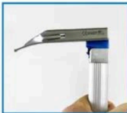
COMBIP ® LARYNGOSCOPE attached blade and handle set