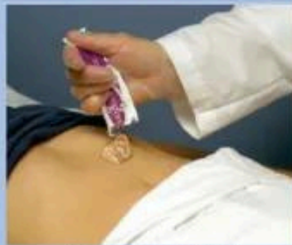
Gel is clear and fragrance-free

NEXT Medical Products Company 45 Columbia Road, Branchburg, NJ 08876 USA customerservice@nextmedicalproducts.com